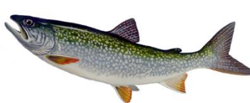
Lake Trout ( Salvelinus namaycush )