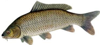
Common Carp ( Cyprinus carpio )