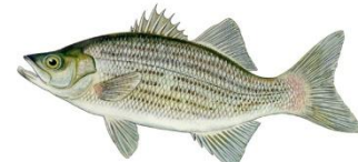
White Bass ( Morone chrysops )