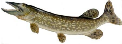
Northern Pike/Jackfish ( Esox lucius )