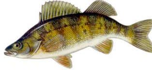
Yellow Perch ( Perca flavescens )