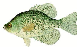
Black Crappie ( Pomoxis nigromaculatus )