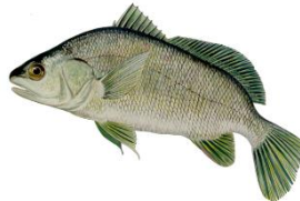
Freshwater Drum ( Aplodinotus grunniens )