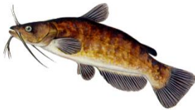
Brown Bullhead ( Ameiurus nebulosus )