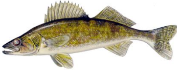
Walleye/Pickerel ( Sander vitreus )