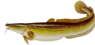
Burbot/Mariah ( Lota lota )