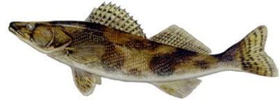
Sauger ( Sander canadensis )