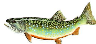
Brook Trout ( Salvelinus fontinalis )