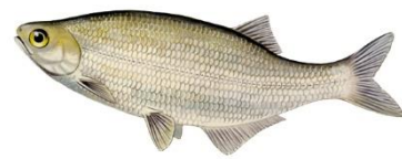
Goldeye ( Hiodon alosoides )