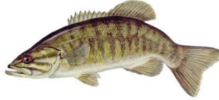
Smallmouth Bass ( Micropterus dolomieu )